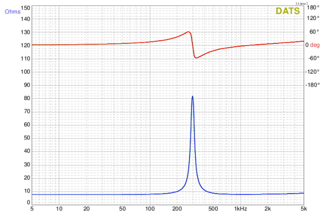
Measurement taken with transducer uncoupled facing upward.