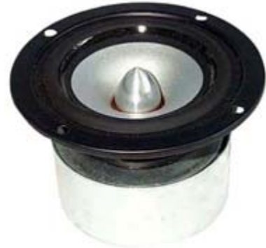
3" PAPER FULL RANGE