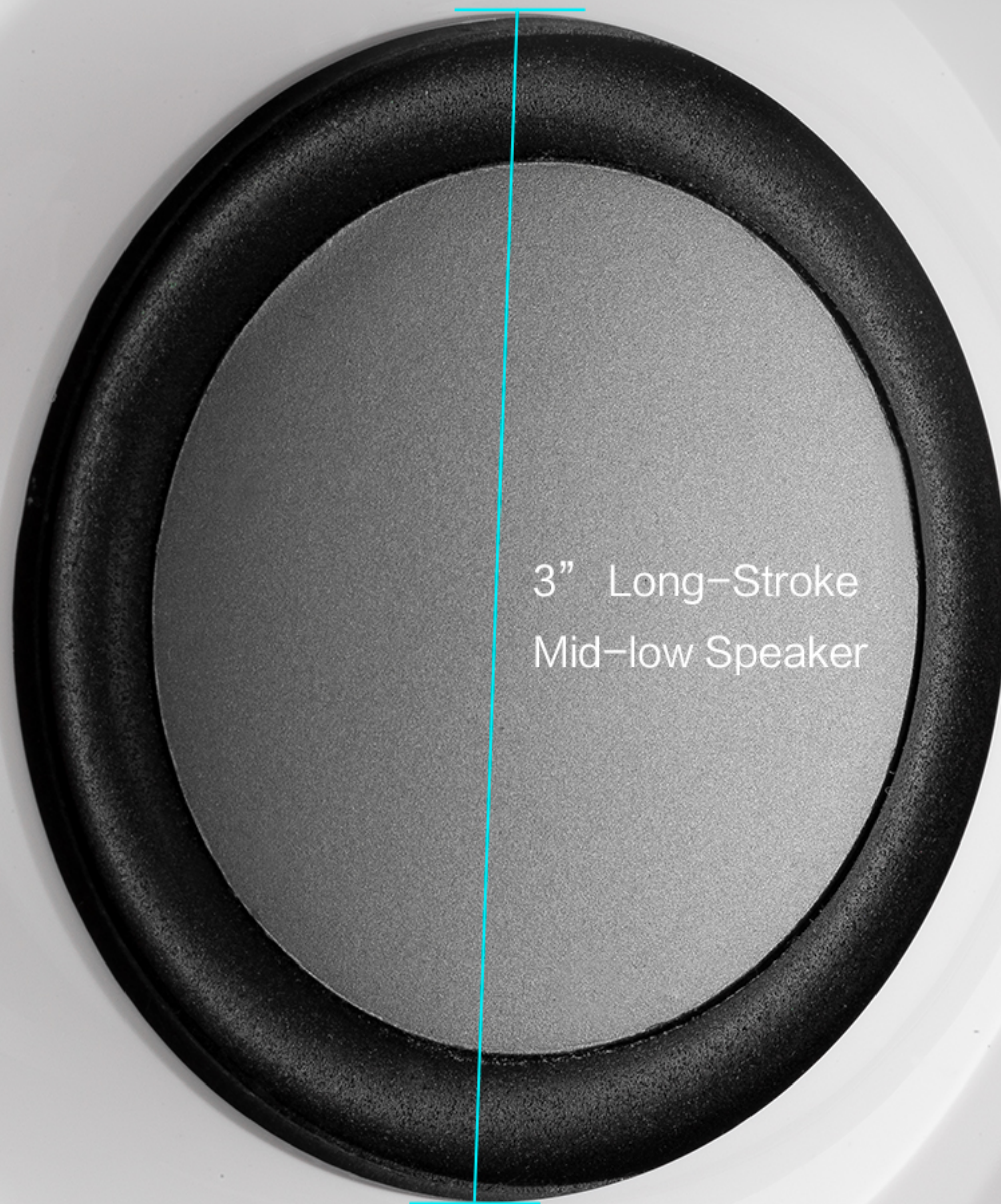
3" Long-Stroke Mid-low Speaker

The diaphragm is made of paper mixed materials to create wide and flat frequency response. It also has good damping characteristics, which makes more outstanding transient response and detail performance.